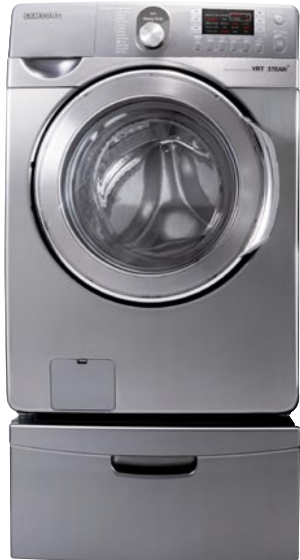
(Shown with optional pedestal)

Samsung's Vibration Reduction Technology (VRT™) allows installation on second floors or near bedrooms because it provides smooth operation at spin speeds up to 1300 revolutions per minute, significantly reducing vibration and noise while improving handling of unbalanced loads.