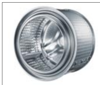
Stainless Steel Diamond Drum