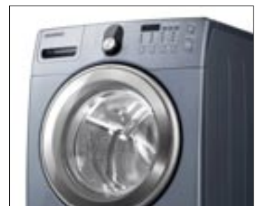
WF218ANB – Side View