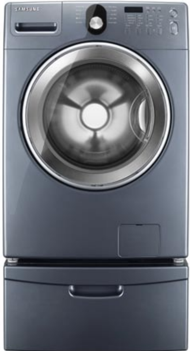
(Shown with optional pedestal)

Samsung's Vibration Reduction Technology (VRT™) allows installation on second floors or near bedrooms because it provides smooth operation at spin speeds up to 1100 revolutions per minute, significantly reducing vibration and noise while improving handling of unbalanced loads.