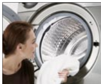
Large 4.0 cu.ft. Capacity