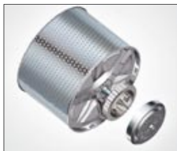
Direct Drive Inverter Motor