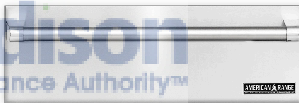
VILLA 27" PROFESSIONAL STAINLESS STEEL WARMING DRAWER WITH CLASSIC HANDLE. ARR-27WD