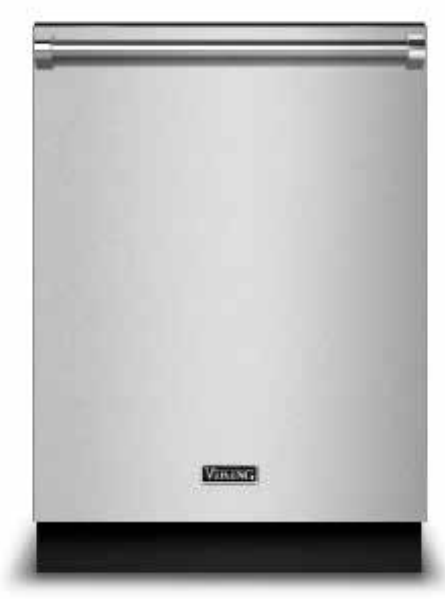
24" Wide Dishwasher