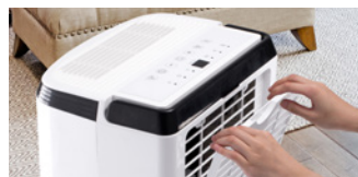
Washable Dust Filter and Filter Clean Alert