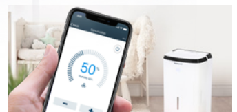
Amazon Alexa Voice Control