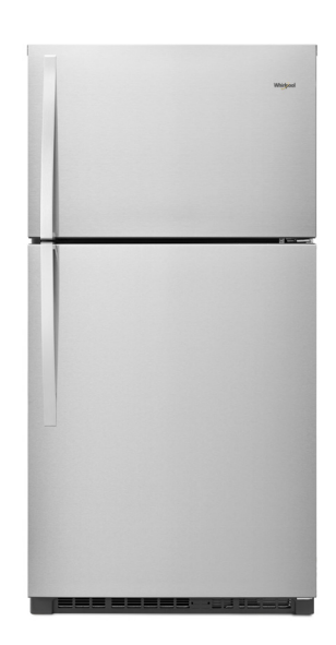
Fingerprint-Resistant Stainless WRT541SZDZ