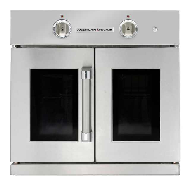
SEF-30 SHOWN IN STAINLESS STEEL, AVAILABLE IN ANY RAL COLOR