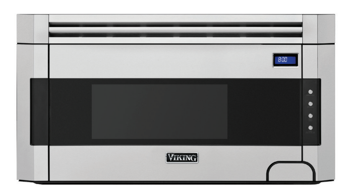
30" Wide Conventional Microwave Hood