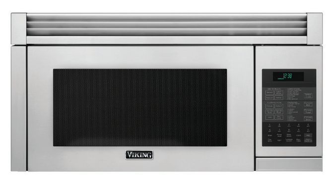
30" Wide Convection Microwave Hood