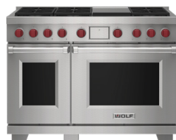
Wall oven and cooktop OR any size range*