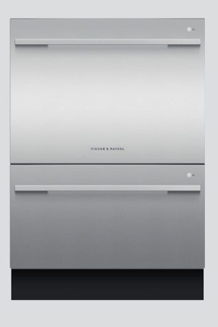
ANY DISHDRAWER™ DISHWASHER