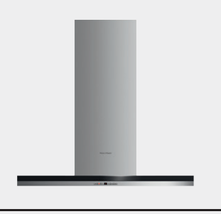
ANY 30" OR 36" RANGE HOOD