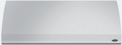
Any Range Hood or Downdraft