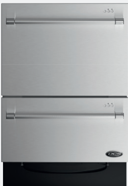
Any DishDrawer™ Dishwasher