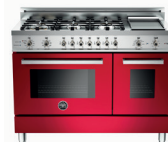
BURGUNDY (VI) PRO48 6G DFS VI