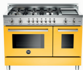
YELLOW (GI) PRO48 6G DFS GI