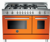
ORANGE (AR) PRO48 6G DFS AR