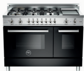
BLACK (NE) PRO48 6G DFS NE