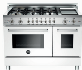
WHITE (BI) PRO48 6G DFS BI