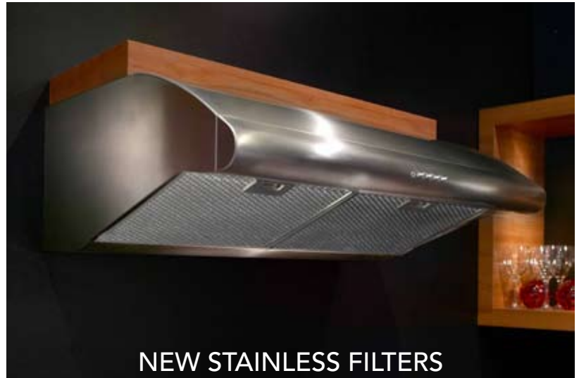
NEW STAINLESS FILTERS

30 Stainless PELL30SS 36 Stainless PELL36SS