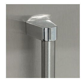
Optional Professional Handle