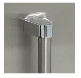
Optional Professional Handle