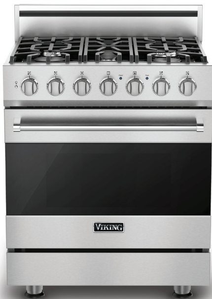
30" Wide Gas Self-Clean Range (Shown with optional 6" H. backguard)