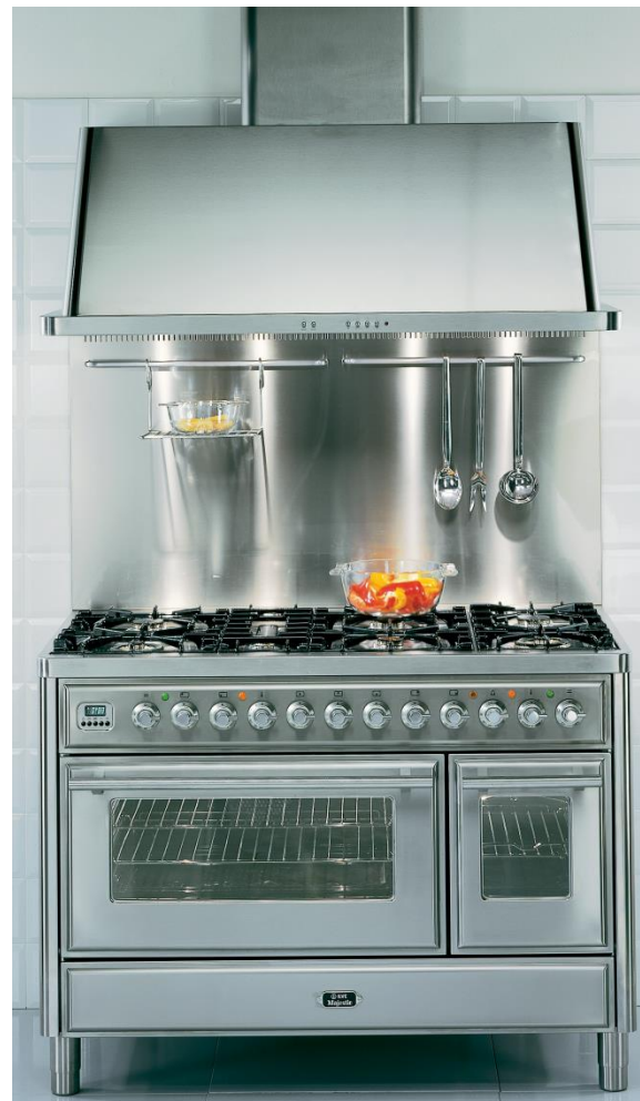
Easy Glide Rolling Racks included