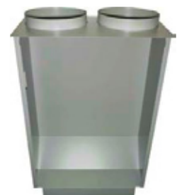
Dual inlet plenum used on the 5-ton.