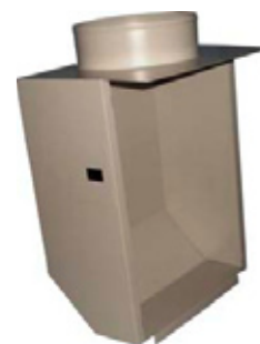
Single inlet condenser plenum used on all models except 5-ton.

2DCP ... Condenser Inlet Air Plenum allows condenser air to be ducted into the unit from outside the conditioned space if required. This also eliminates negative air pressure in the space being cooled by eliminating infiltration. 2DCP-1 fits 20ACH12, uses one 12 in. duct and can handle 25 equivalent ft. 2DCP-2 fits 20ACH18, 24, uses one 12in. duct and can handle 50 equivalent ft. 2DCP-3 fits 20ACH 35, uses one 12 in. duct and can handle 50 equivalent ft. 2DCP-4 fits 20ACH60, uses 2 12 in. ducts and can handle 80 equivalent ft.