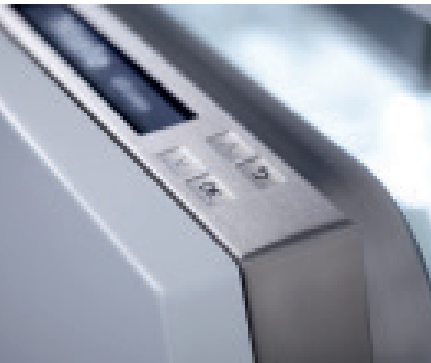
Touch on metal