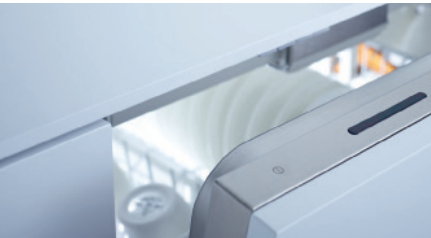
Time Control Lights