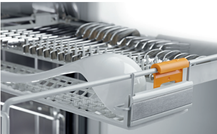
3D cutlery tray