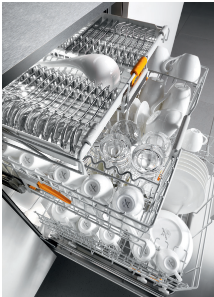
FlexiCare Deluxe basket design