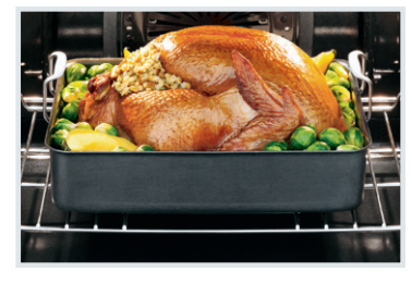
One-Touch Keep Warm Setting Just one touch of a button keeps food warm until everything - and everyone - is ready.