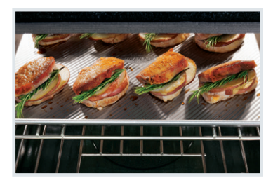
Vari-Broil<sup>™</sup> Temperature Control Select from six broil temperatures.