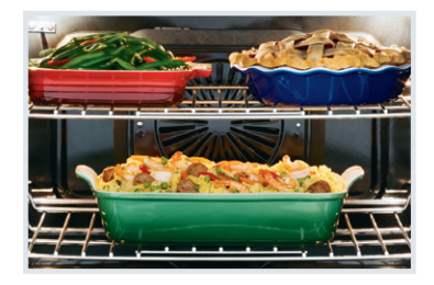
True Convection Single convection fan circulates hot air throughout the oven for faster and more even multi-rack baking.