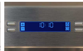
Multi-function electronic controls with LCD display