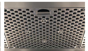
Stainless Steel Micro Hole Filters