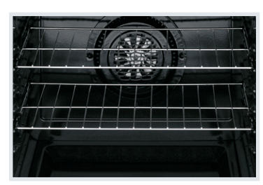
One-Touch Quick Self Clean Your oven cleans itself — so you don't have to. Self clean options available in 2-, 3- and 4-hour cycles.