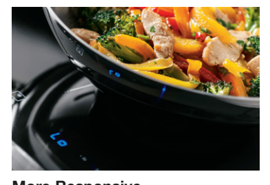
More Responsive Cooking with induction is more responsive than gas or electric — you can instantly take the heat from boil to simmer.

Custom-Set<sup>™</sup> Touch-Controls Integrated within the cooking surface for a clean look, electronic touch-controls give you accurate control over cooking temperatures.