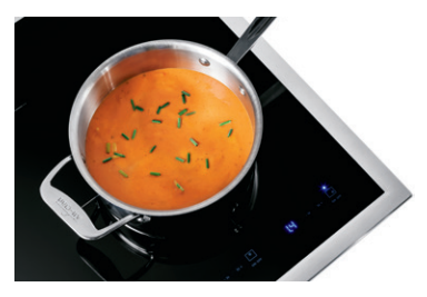
Exceptional Temperature Control Adjust heat with greater precision than on gas or electric cooktops, especially at lower settings. Ideal for melting chocolate and cooking delicate foods and sauces.