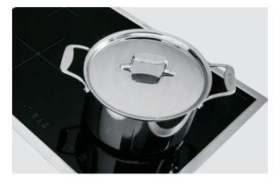
Boil Water Quickly Induction technology is more responsive than gas or electric, and the Power Assist<sup>™</sup> function generates rapid heat, so you can bring water to a boil quickly.