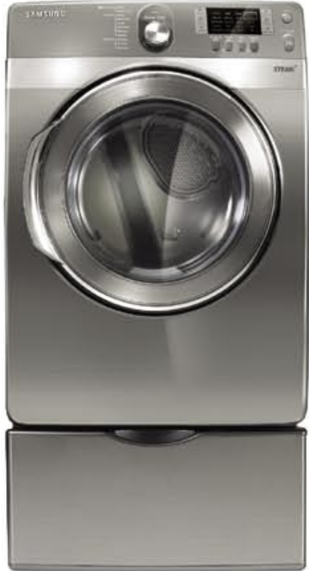
(Shown with optional pedestal)