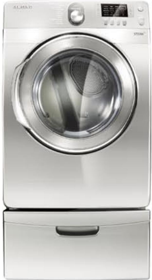
(Shown with optional pedestal)