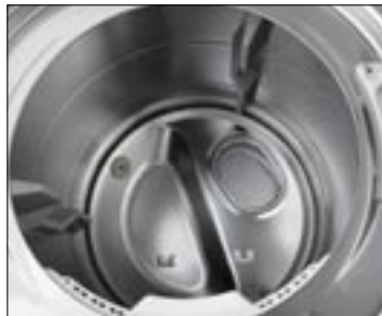
Large 7.3 cu. ft. Capacity and Stainless Steel Drum