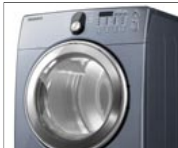
DOT LED Center Jog Dial