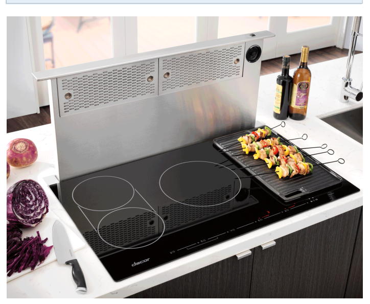
DYTT365NB with ERV3615