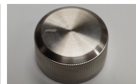
Stainless Rotating Knob Controls