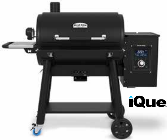
Regal Pellet 500 PRO