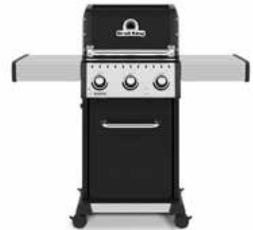
Baron 320 Pro