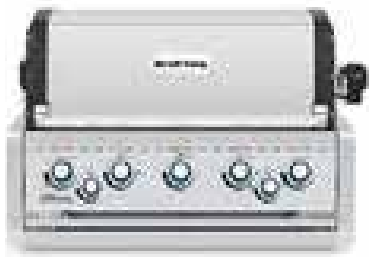
Imperial S 570