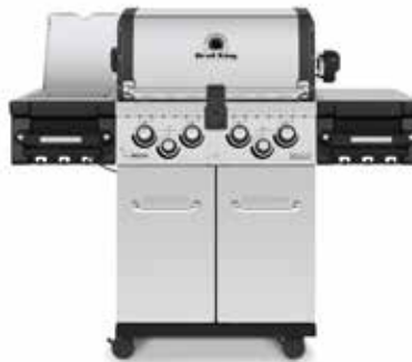
Regal S 490 Pro IR