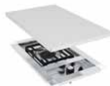
Single Side Burner