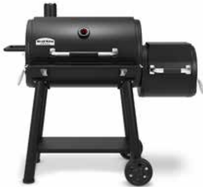
Regal Charcoal Offset 500