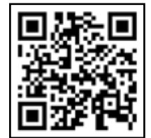
Cabinet Smoker Assembly Gas

Cabinet Smokers are designed for the weekend griller who loves great smoky flavor. A double-walled body and doors provide superior heat control and durability while cast-aluminum Roto-Draft™ dampers regulate the temperature. (Finish: Double-walled Steel construction, Premium Epoxy High Heat Paint)