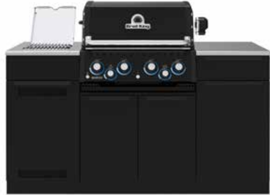
490i Shadow Island

Finally a smarter choice for grilling centers. Broil King's Baron Island series is a match of performance and luxury designed for the professional outdoor chef.