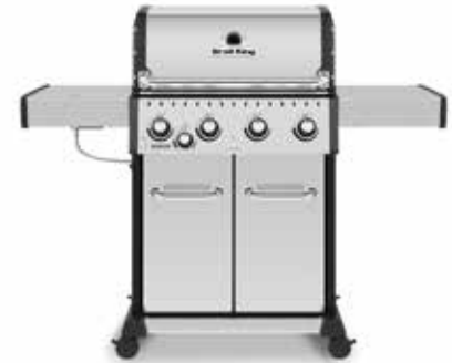
Baron S 440 Pro IR