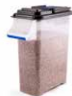
Pellet Storage Bin BK66900