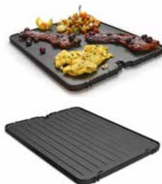
Deluxe Griddle BK11237