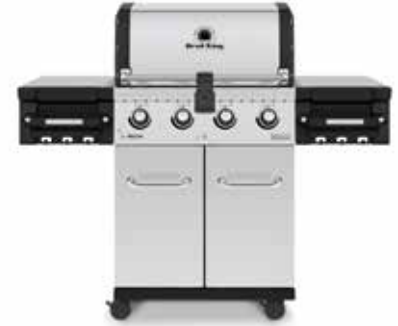
Regal S 420 Pro