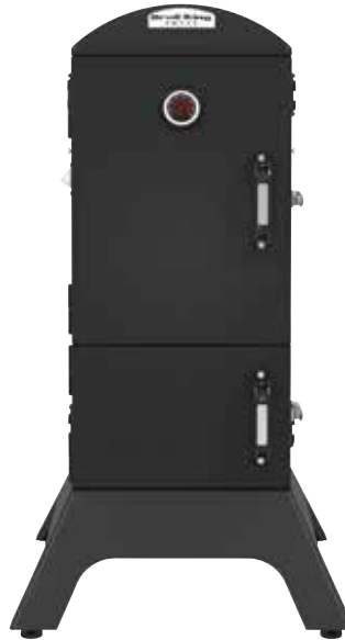
Vertical Smoker, Charcoal