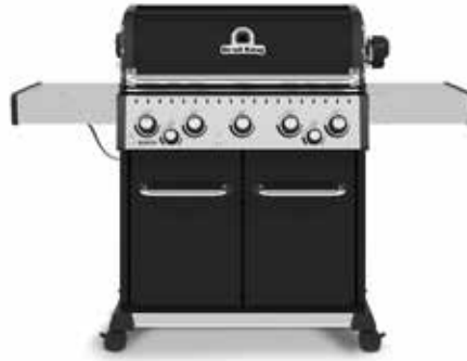
Baron 590 Pro