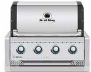
Regal S 420