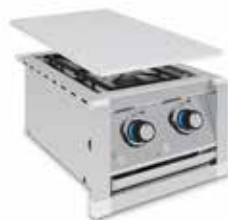
Double Side Burner