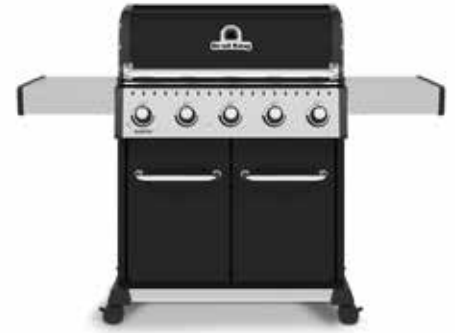
Baron 520 Pro