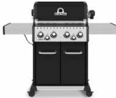
Baron 490 Pro (Shadow Model Not Shown)