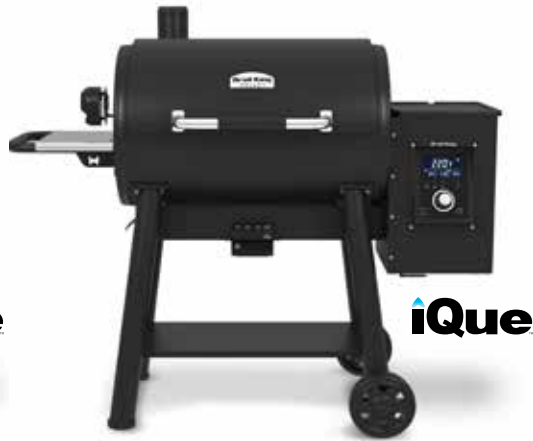
Regal Pellet 500