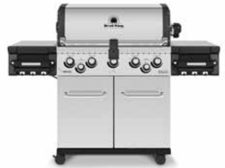
Regal S 590 Pro