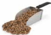
Pellet/Charcoal Scoop BK63946