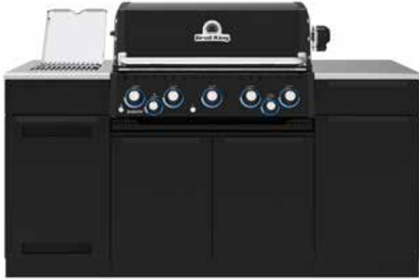
590i Shadow Island