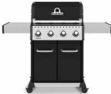
Baron 420 Pro