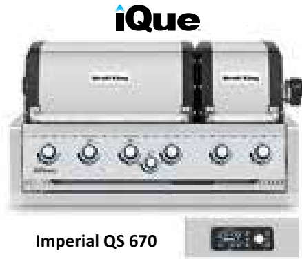
Imperial QS 670