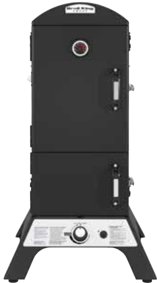
Vertical Smoker, Gas