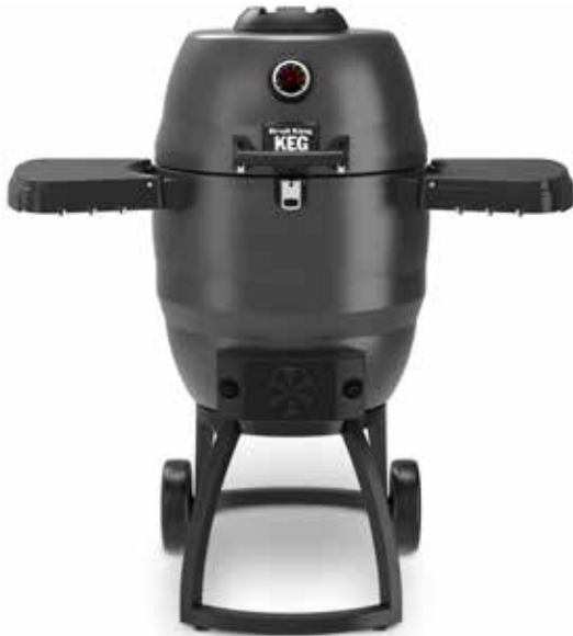
Keg, Charcoal Grill