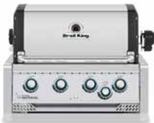
Imperial S 470