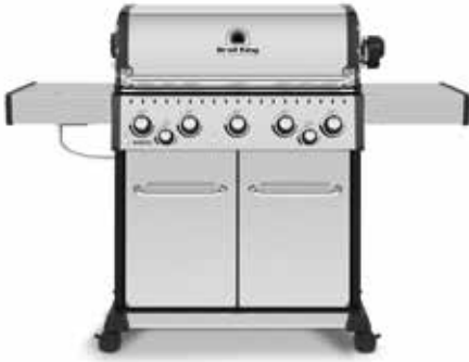
Baron S 590 Pro IR