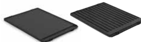
Deluxe Griddle (Reversible) BK11223