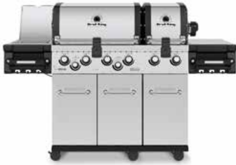
Regal S 690 Pro IR