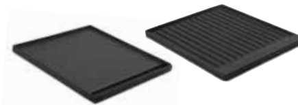
Deluxe Griddle (Reversible) BK11221