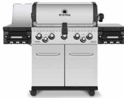
Regal S 590 Pro IR