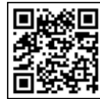
Cabinet Smoker Assembly Charcoal