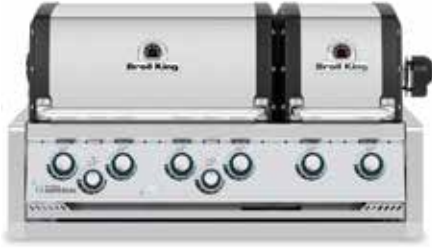
Imperial S 670