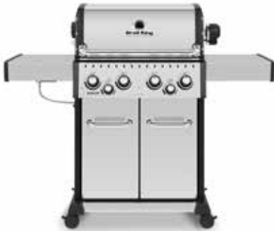
Baron S 490 Pro IR