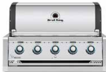
Regal S 520