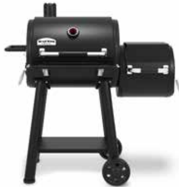
Regal Charcoal Offset 400