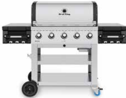
Regal S 510 Commercial