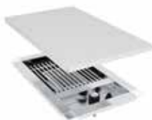
Infrared Side Burner