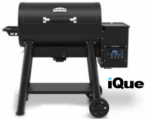
Crown Pellet 500