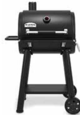
Regal Charcoal 400

From durable construction and stylish accents to exceptional cooking versatility, the Broil King line of charcoal grills and smokers brings people together. Great food, great flavor, great barbecues every time. (Finish: 2mm/14 gauge Steel with Black finish)