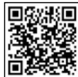
iQue Technology Video