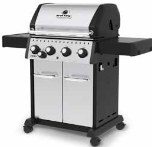
Crown S 440