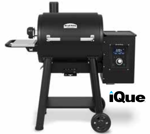
Regal Pellet 400