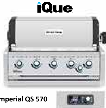
Imperial QS 570