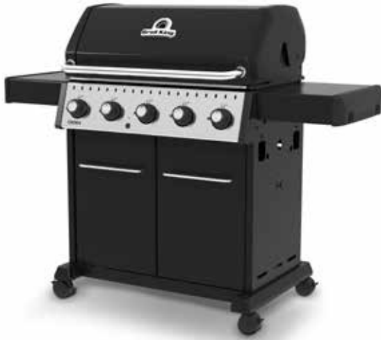
Crown 520 (Shadow Model Not Shown)