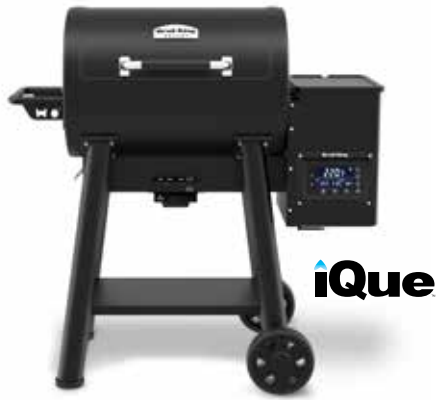
Crown Pellet 400