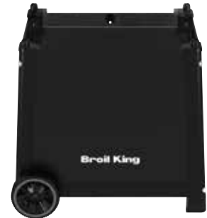
Porta-Chef 320 Cart

Cooking on-the-go has never been more convenient than with the newly designed Porta-Chef® series. These grills offer an exceptional amount of grilling space compared to other portable grills, allowing you to cook delicious meals for the whole family or a feast for friends before the big game. The sturdy legs quickly snap into place providing a stable stand-alone grill. (Finish: SS = Stainless Steel Hood Insert with Black Legs and Folding Shelves, Alum/Black = Aluminum Hood with Black Legs and Shelves)