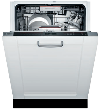
SHV89PW53N Custom Panel

The MyWay™ easily fits larger & deeper items like cereal bowls, freeing up extra space for pots & pans in the bottom rack.