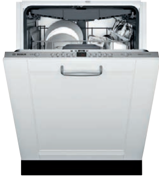
SHV863WD3N Custom Panel

The 3rd rack provides the perfect space for silverware and large utensils while its V shape leaves room below for taller items.