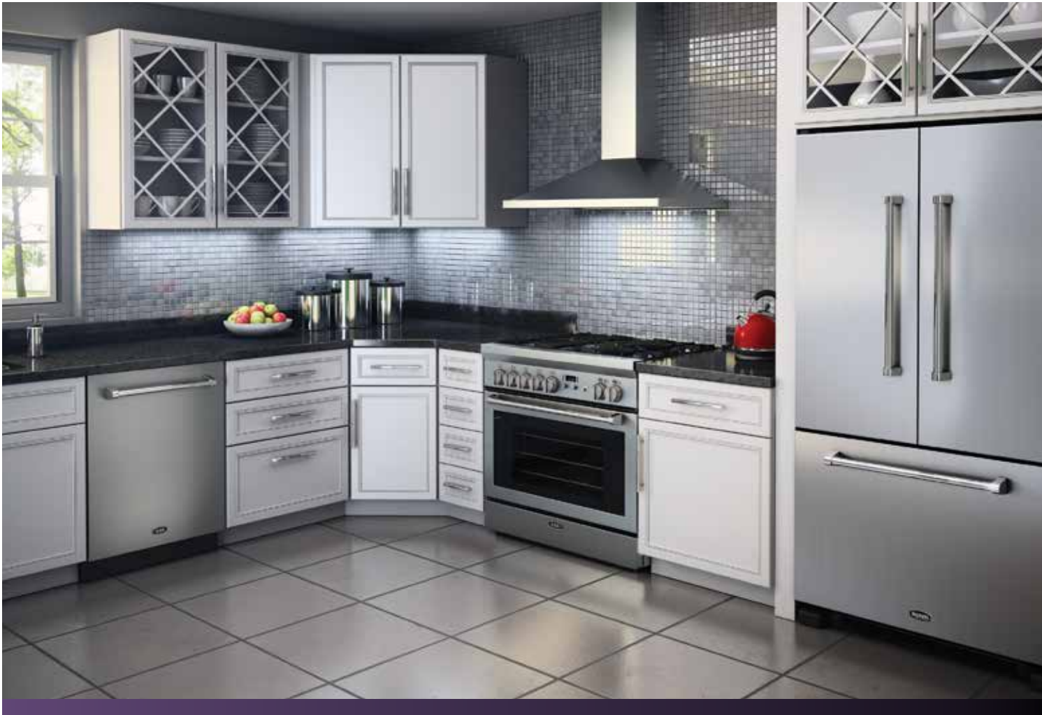
The New AGA MARVEL Professional Kitchen Suite