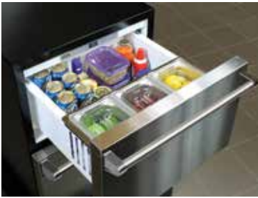
E-Z Stor organization system keeps food fresh while separating odors and flavors

Long-lasting freshness and large capacity – our Refrigerated Drawer units deliver both beautifully. Full extension, self-closing drawer glides give you easy access from above, with everything in view and within easy reach. Extra deep bottom drawers allow most 2-liter and opened wine bottles to be stored vertically. Bright white LED lighting and white interiors provide the perfect environment for fresh food storage, and our Dynamic Cooling™ Technology gives you quick temperature recovery even with frequent usage.