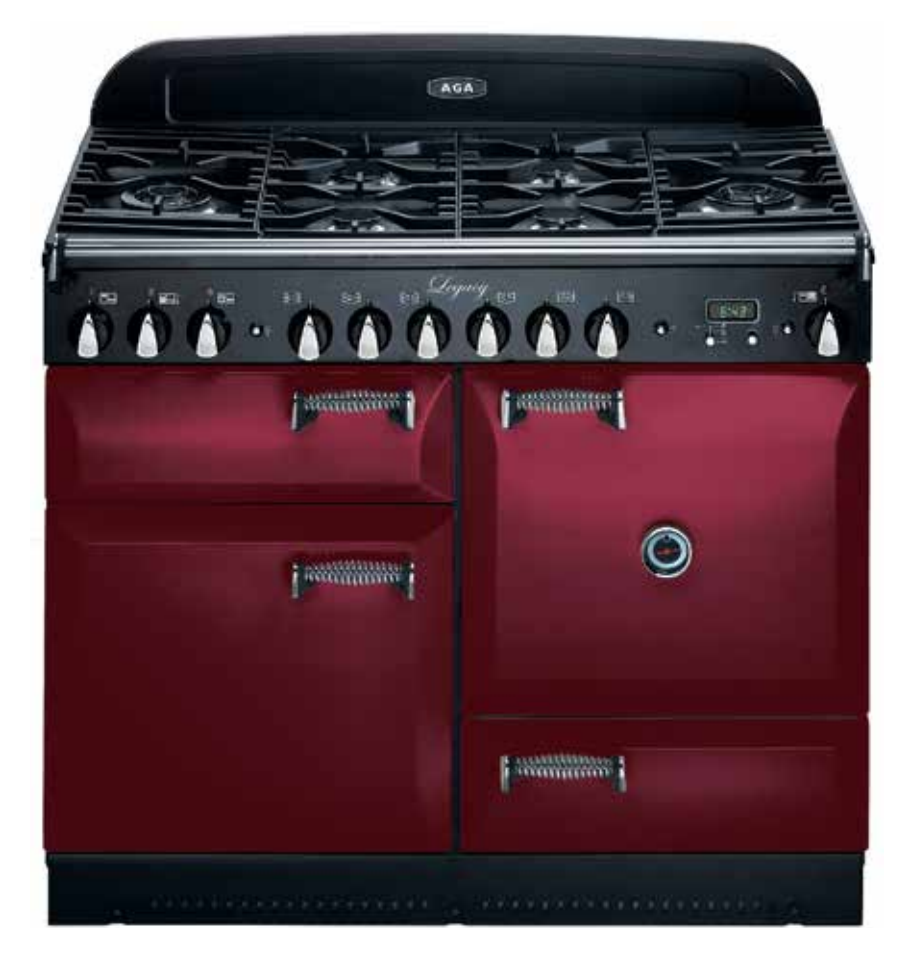
Legacy 44" Solid Door model shown in Cranberry (ALEG-44-DF-CRN)