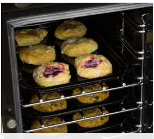
Pictured: (3) 9" x 13" Enameled Baking Trays (SAG-W2787)