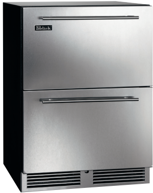
Drawer Model (Indoor)