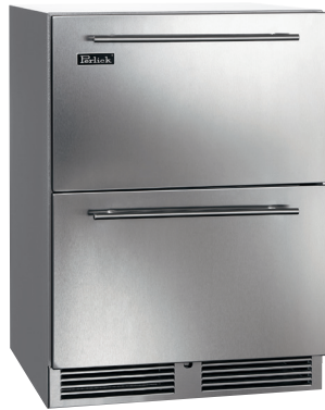
Drawer Model (Outdoor)