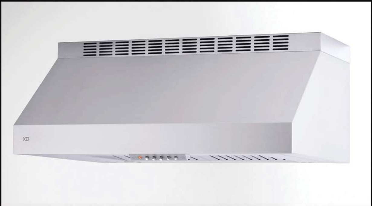
Wall Mount Hood