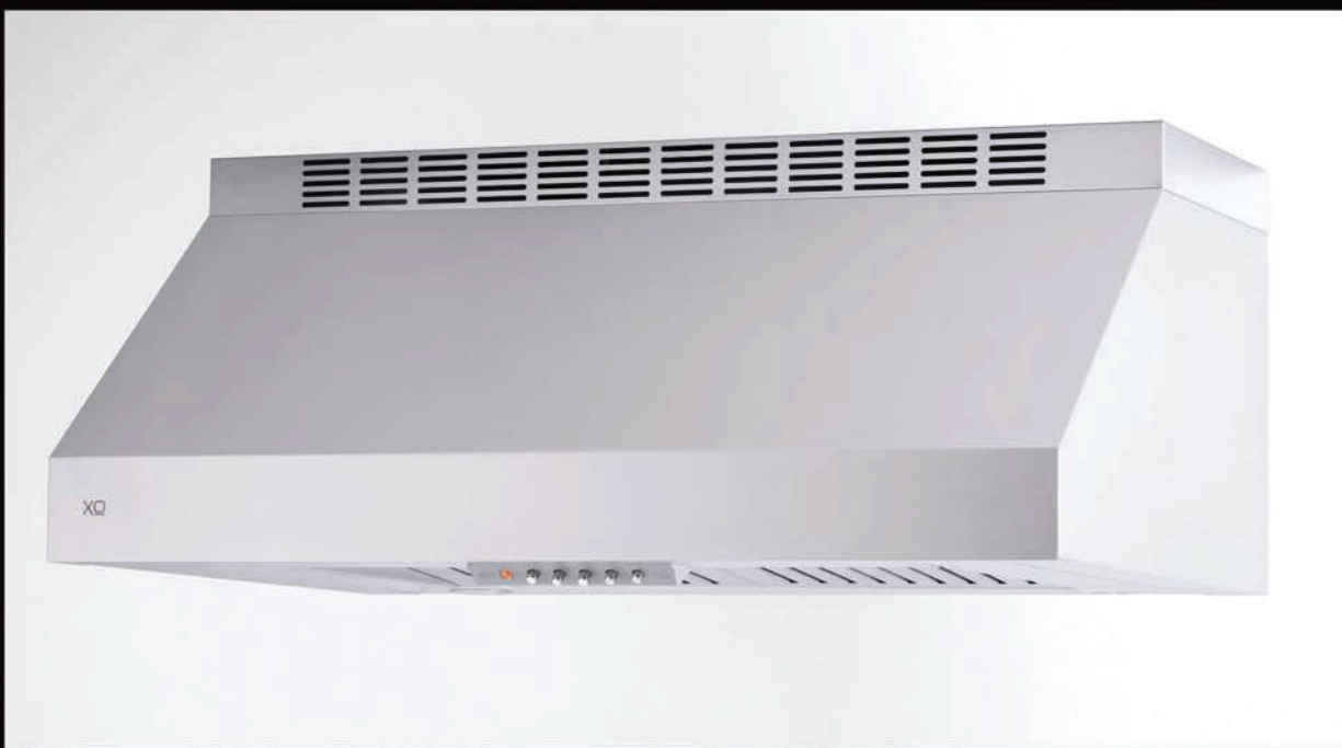
Wall Mount Hood