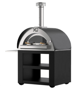
XOPIZZACART1 MOBILE CART A sturdy workhorse with storage below, a convenient slide-out 24" prep shelf built-in, and mounting holes for the optional toolset.