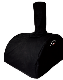
XOPIZZA4 COVER Fits the Tabletop Model and keeps your oven debris-free and protected from the elements.

Your Wood Fired Pizza Oven is capable of cooking just about anything. It is amazing how perfectly it cooks not only stone-baked pizzas and breads, but also sizzling meats, tender seafood, delicious casseroles and beautifully moist cakes and desserts. Experiment with different hardwoods to impart unique smokey flavors to your favorite recipes. Try eggs in a cast iron skillet, veggies on a stainless rimmed baking sheet or gourmet mac 'n cheese in an enamel baking dish. The possibilities are infinite.