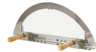
XOPIZZA4GD STAINLESS + GLASS OVEN DOOR Optional Glass Oven Door features the same air control as the Stainless Steel door model.