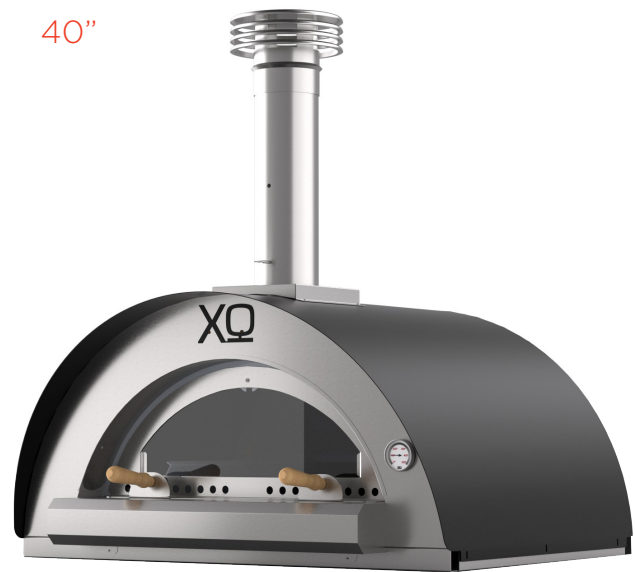
XOPIZZA4 | CARBONA Made in Italy