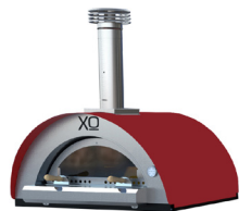
XOPIZZA4 | ROSSO