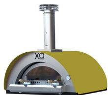
XOPIZZA4 | GIALLO