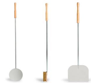
XOPIZZATOOL3 3 PIECE TOOL SET The tools you'll love for reaching all areas of the oven. Side mounting bracket is included.