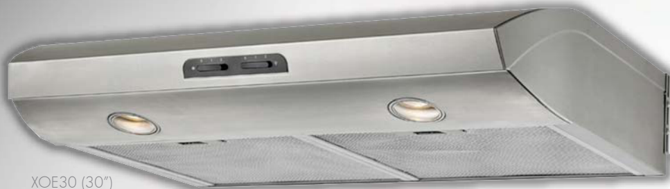
XOE30 (30") shown above