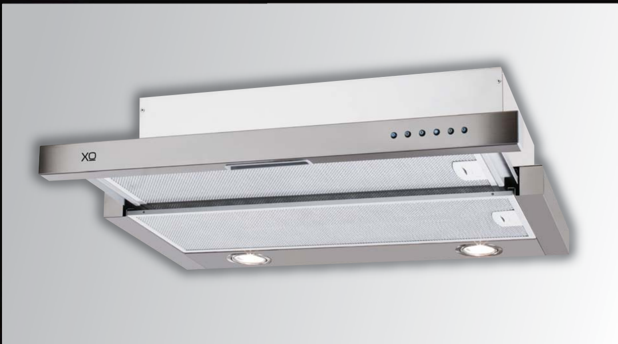
Under Cabinet - Glide Out