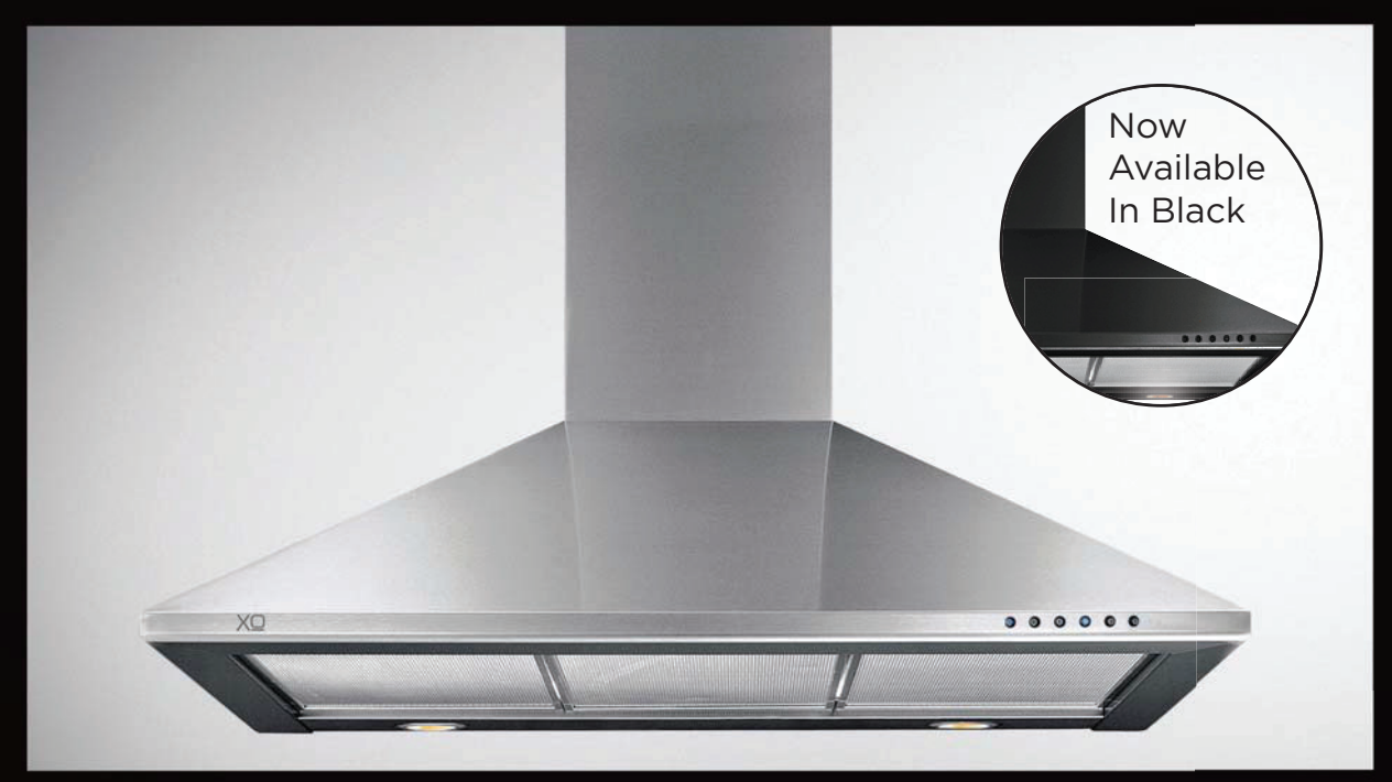
Wall Mount Hood