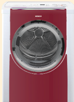
WTMC332RUS/CN (Electric) WTMC352RUC (Gas)