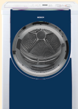
WTMC332BUS/CN (Electric) WTMC352BUC (Gas)