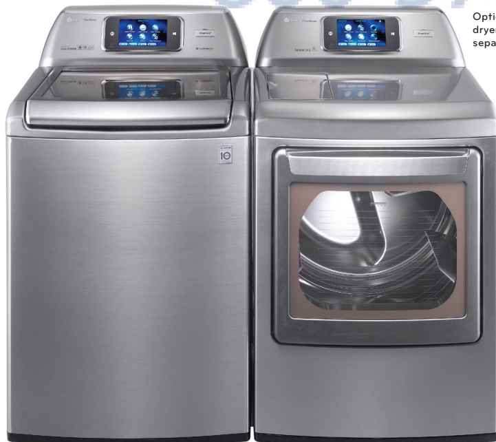
Optional dryer sold separately.