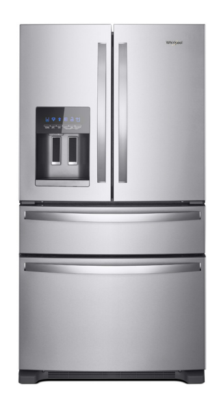
Fingerprint-Resistant Stainless WRX735SDHZ