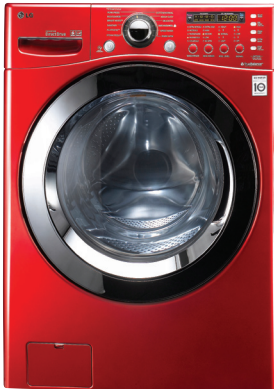
Wild Cherry Red