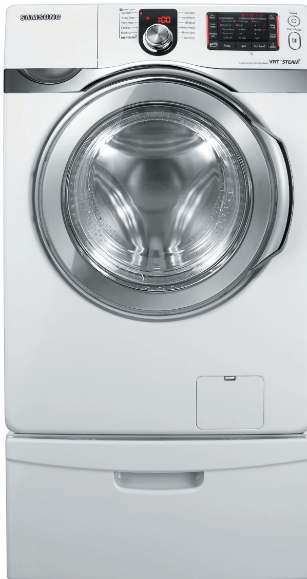
(Shown with optional pedestal)

Delivers more powerful cleaning results by loosening soils and dirt. Steam Care option provides Steam cleaning power to traditional cycles.