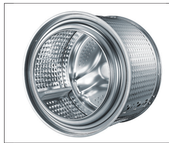
Large Stainless Steel Diamond Drum with 4.3 cu. ft. capacity*