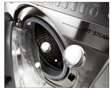
ActivFresh™ Technology actively cleans and freshens clothes in cold water.