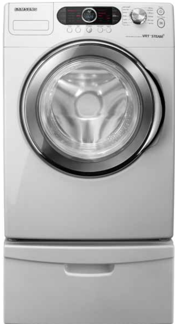
(Shown with optional pedestal)