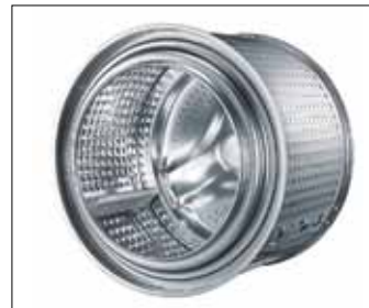
Stainless Steel Diamond Drum