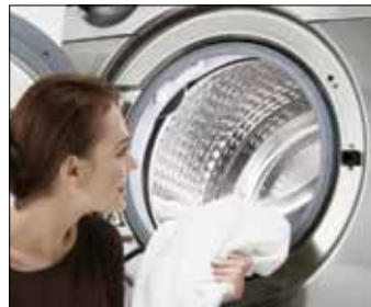
Large 4.0 cu.ft. Capacity *