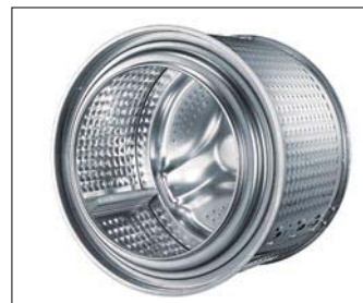
Stainless Steel Diamond Drum