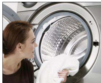
Large 4.0 cu. ft. Capacity *