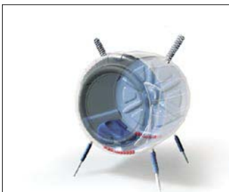
VRT™ Vibration Reduction Technology