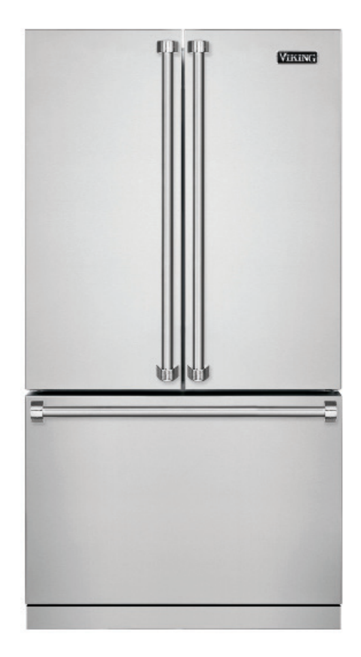
36" Wide Freestanding French-Door Bottom-Freezer